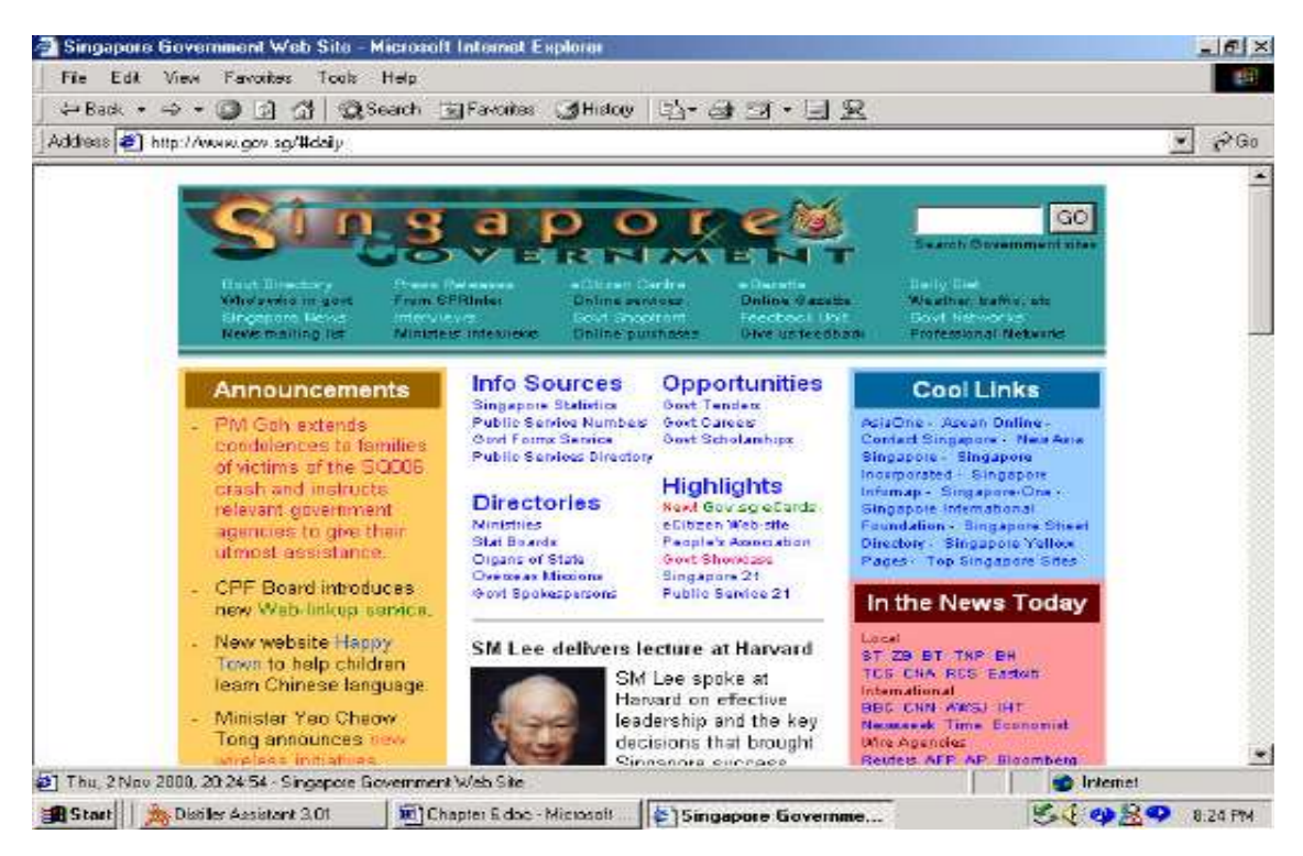
Figure 4. E-governance in Singapore.