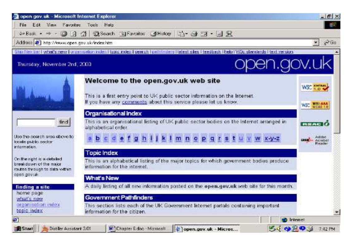
Figure 3. E-governance in UK.