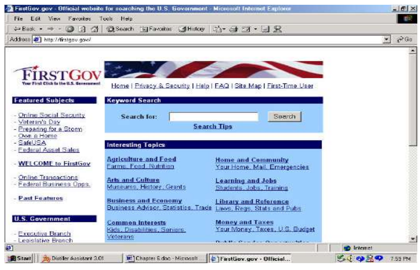
Figure 2. E-Governance in United States of America.