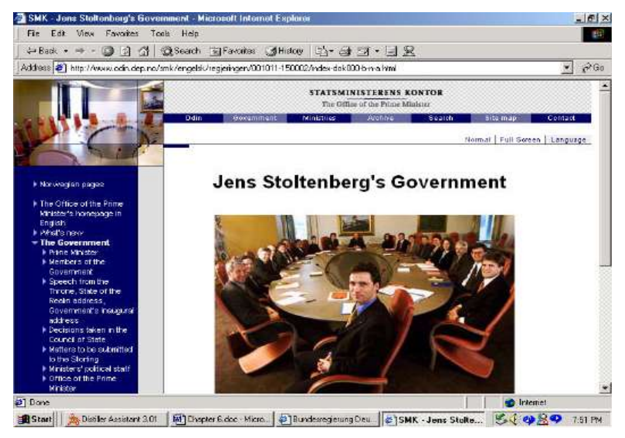
Figure 5. E-governance in Norway. Source: Norris (2000).